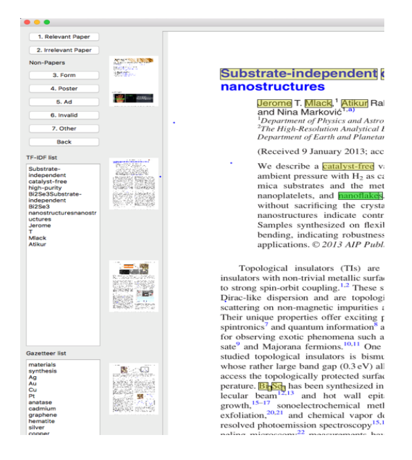
Figure 1. Graphical user interface (GUI) for annotator. Green highlight is gazetteer, yellow represents TF-IDF

We treat this problem as a prerequisite task to document analysis and markup. Figure 1 depicts a graphical user interface for collecting this information by previewing documents. The annotator buttons record class labels for each document, which is previewed in the GUI.